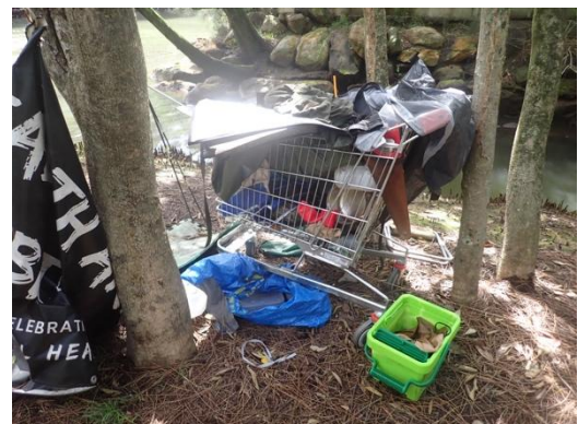
Part of the campsite

This Project received Grant funding from the Australian Government through the Environment Restoration Fund.