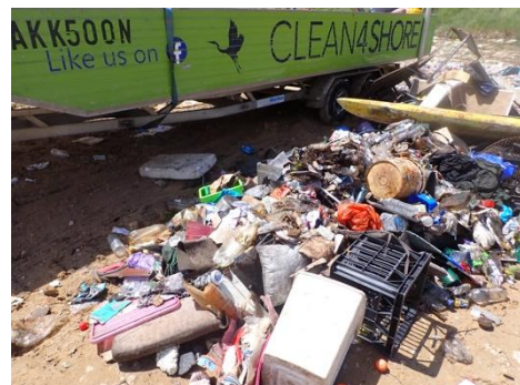
Larger items collected today tyres/metal recycled