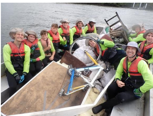
Full load returning