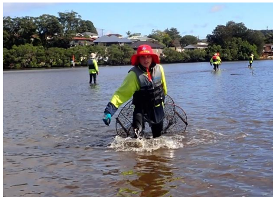
One of four crab traps removed from Erina Bay