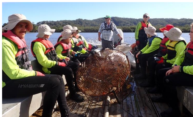
Part of our load from Erina Bay