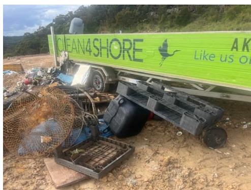
Larger items from Erina Bay & Creek