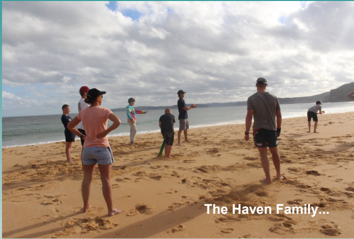
The Haven Family...