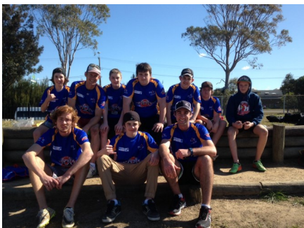
2015 Haven Oztag Team