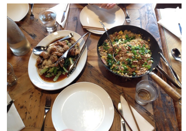
Cooking with Julie Goodwin