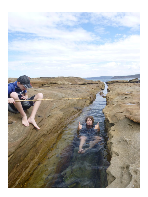
Haven Camp – Putty Beach – 30<sup>th</sup> & 31<sup>st</sup> March, 2016