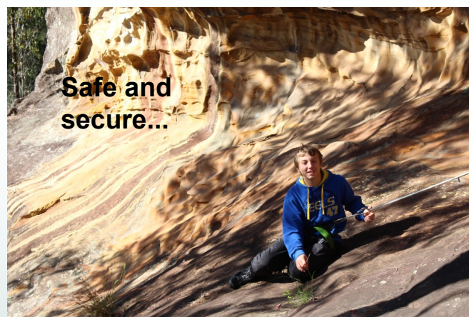
Safe and secure...