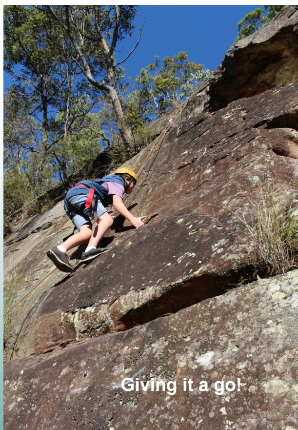
Giving it a go!

In the last week of term, students who had participated in the Project Based Learning task on Bikes, were treated with a day at the Terrigal BMX track! To earn the right to come, students needed to repair a part of the bike and put it back together. They had to create a model of a track using the appropriate shapes and design a poster outlining the parts of their bike that made it better than others. After walking the track and getting a feel for it, they participated in a time trial. They were separated into two groups, based on time, where they could then race each other. During the time trials there were several younger kids, who were sharing the track, who fell and it was great to see our students racing to the aide of these young kids and help them back up again! The students spent a lot of energy on the track and came back to school exhausted. It was great to see the students participating in an age appropriate activity and hopefully some of these students will continue to participate in these physical activities outside of school.