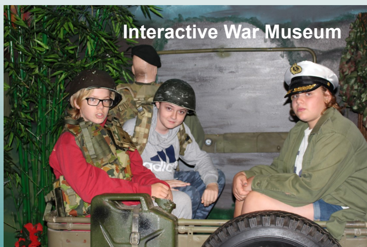
Interactive War Museum