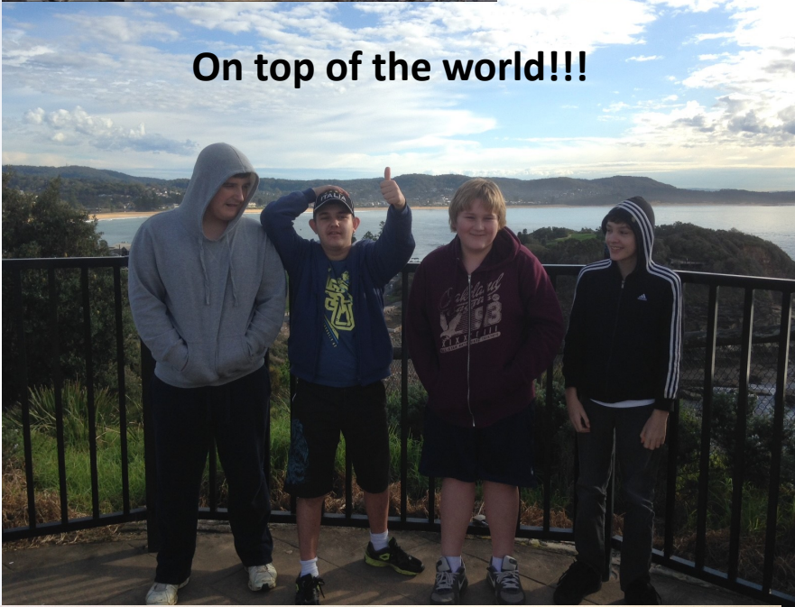
On top of the world!!!