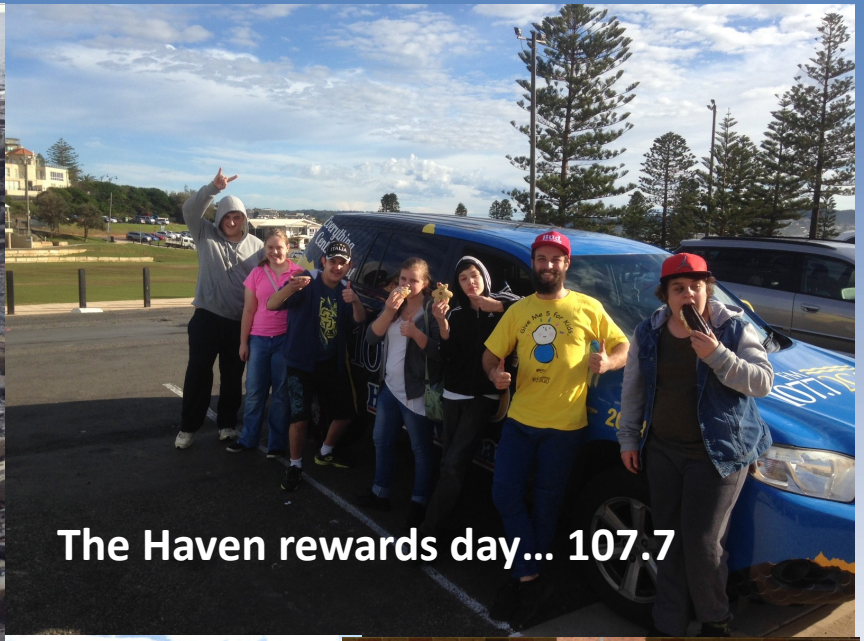
The Haven rewards day... 107.7