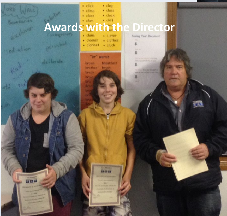
Awards with the Director