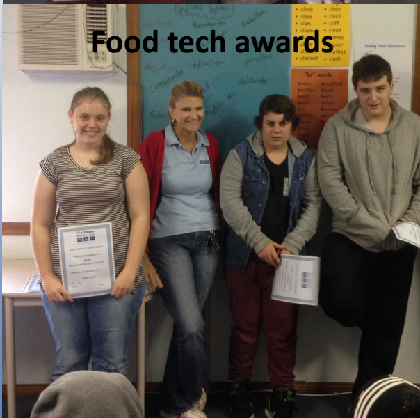
Food tech awards