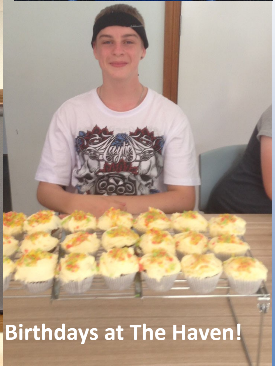
Birthdays at The Haven!