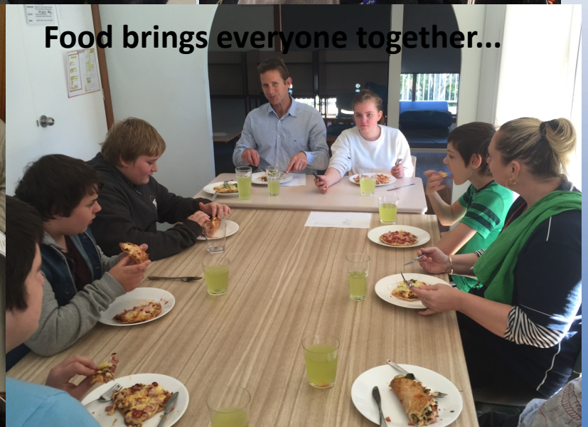
Food brings everyone together...