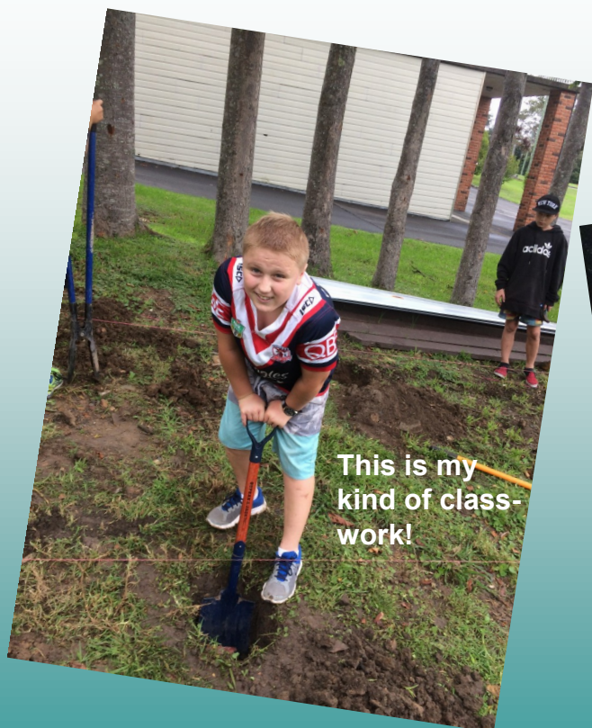
This is my kind of class-work!

This term two staff participated in a professional development in the Kitchen to Garden workshop held at Bondi Beach Public School. The day was designed to educate staff on ways that they could incorporate garden activities into the curriculum and how to then use that produce in the kitchen to provide healthy meals for the students. The day reinforced what we already do and gave us huge pool of resources and connections that we can use to engage our students in garden activities and getting them involved in healthy food preparation. The organisation was that impressed with what we do they are going to run a feature article on The Haven Education Centre in their next newsletter that goes out to likeminded Kitchen to Garden schools all over Australia. Next term I look forward to completing the construction of our very own Chicken Coop and being able to care for these chickens and hopefully get some fresh eggs in return that we can use in our breakfast club. A big thanks to our community for supporting the project in particular, St Edwards College, Mitre 10 Kincumber, Kincumber Pet Produce, Bunnings West Gosford and the parents of our students that donated money and materials in support of this project.