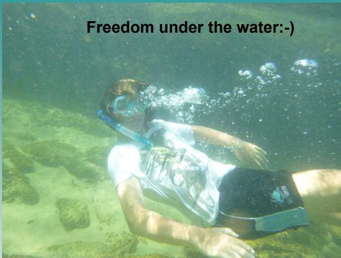
Freedom under the water:-)