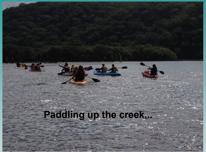
Paddling up the creek...