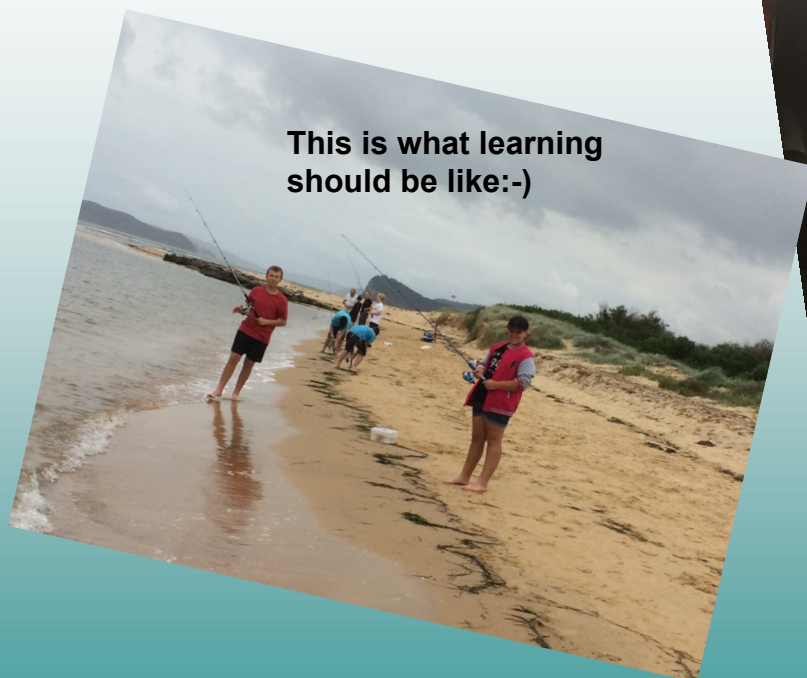
This is what learning should be like:-)