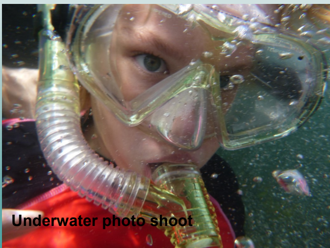
Underwater photo shoot