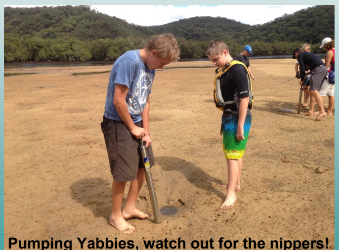
Pumping Yabbies, watch out for the nippers!