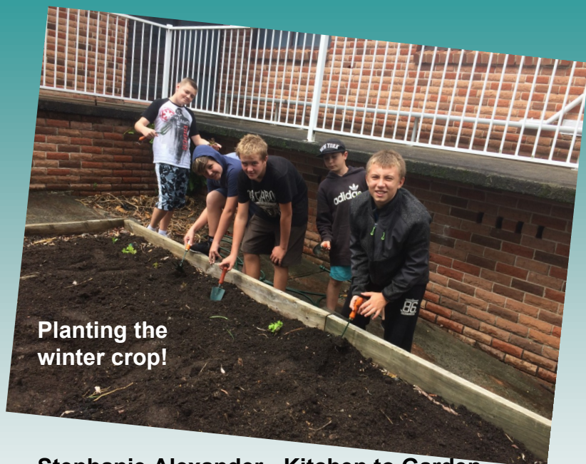
Planting the winter crop!