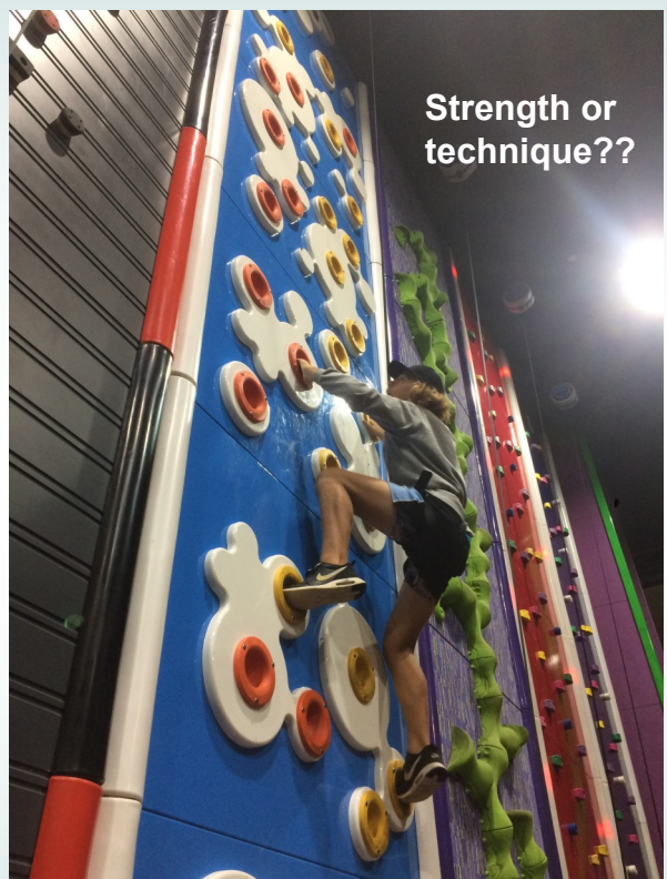
Strength or technique??