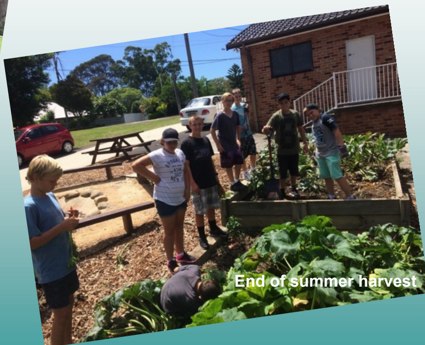
End of summer harvest