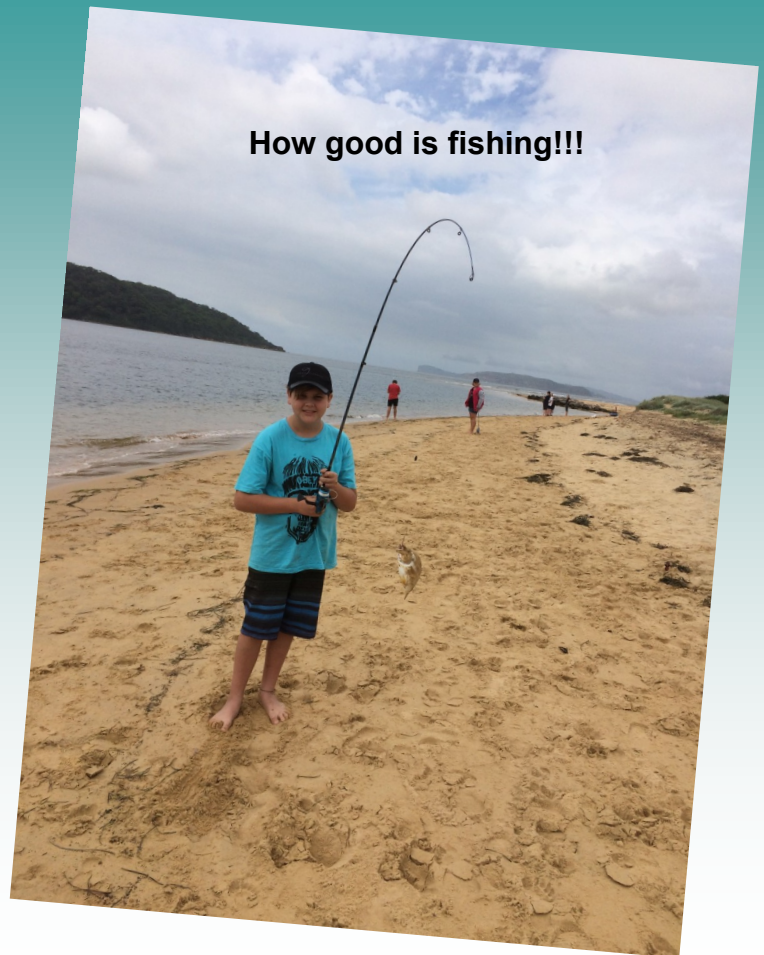
How good is fishing!!!